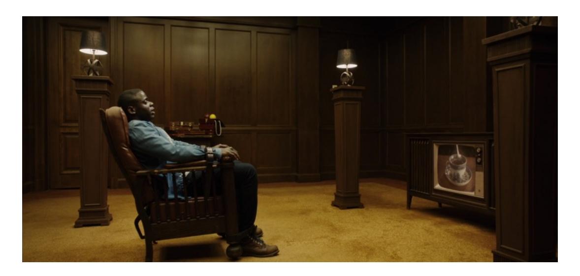
Screening: Get Out (Jordan Peele, 2017)